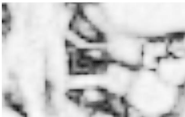
MRI Head sagittal section (enhanced detail)

However, on any objective view this explanation must be untenable. For instance, if one views the forwardmost of the two items pointed out above in detail (shown below with elevated tones), from the MRI image adjacent in the series to the one above, one can quite clearly perceive the internal rectilinear 'G' structure of the object, confirming beyond doubt its artificial construction: